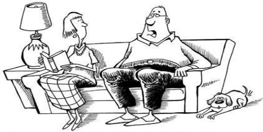
IF A MAN YELLS "YOU LIE!" IN A ROOM FULL OF POLITICIANS, HOW DO THEY KNOW WHO HE'S TALKING TO?