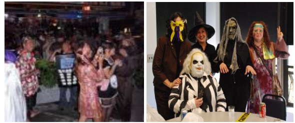
Mediocre food and bad beer!

Meet The Politicians Nite Nov. 6 th 7 PM