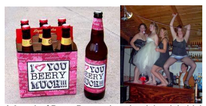
A 6 pack of Beery Beer and our local dancin' girls!