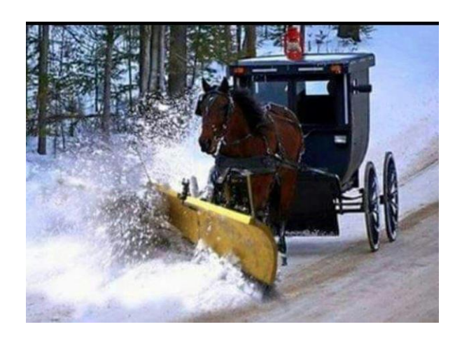
Call 1-800-Vee Blow (Dat's our zell phone 'cause we can't get caught yuzing a land line!)