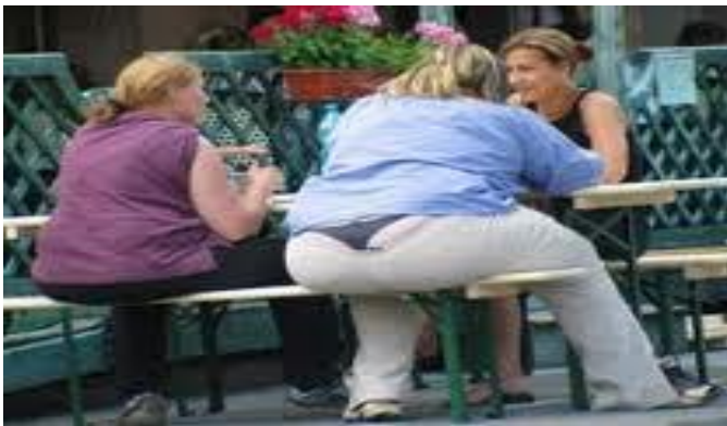
Fat Busters is the answer! Call 545-FATT NOW!