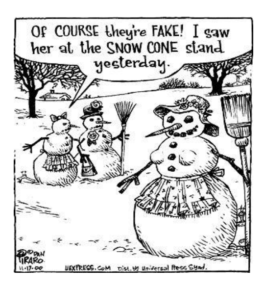
Get Your Holiday Cheer At Boobs 'N Beer