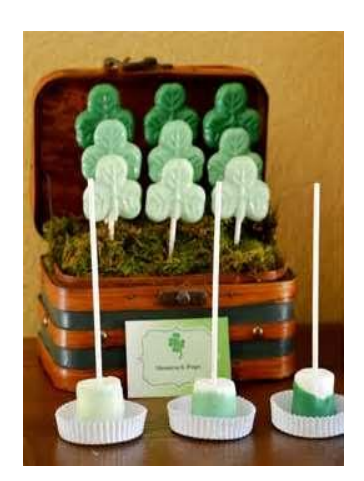
Order your Irish Creme Suckers Before St. Paddy's Day

When I die, I'm going to leave everything to you. You already do, you lazy bastard!